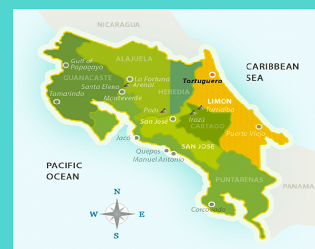
Map of Costa Rica