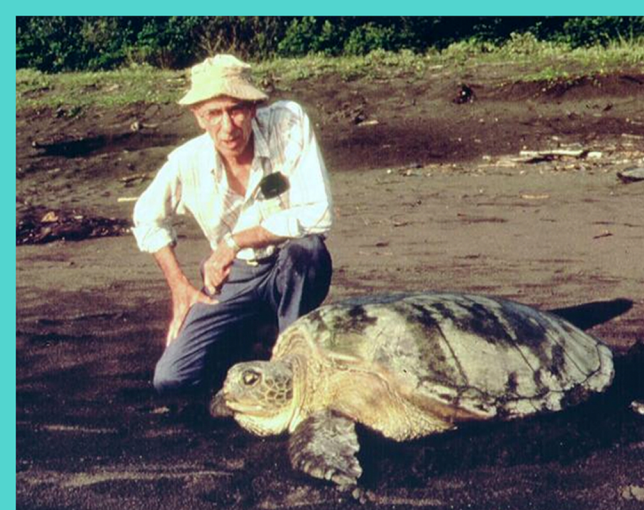
Archie Carr, Tortuguero