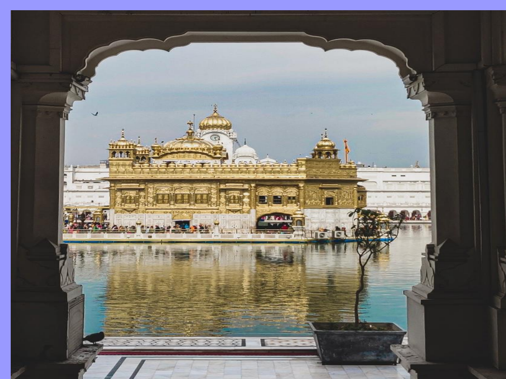
Photo of a Gurdwara (Sri Harmandir Sahib in Amritsar, Punjab