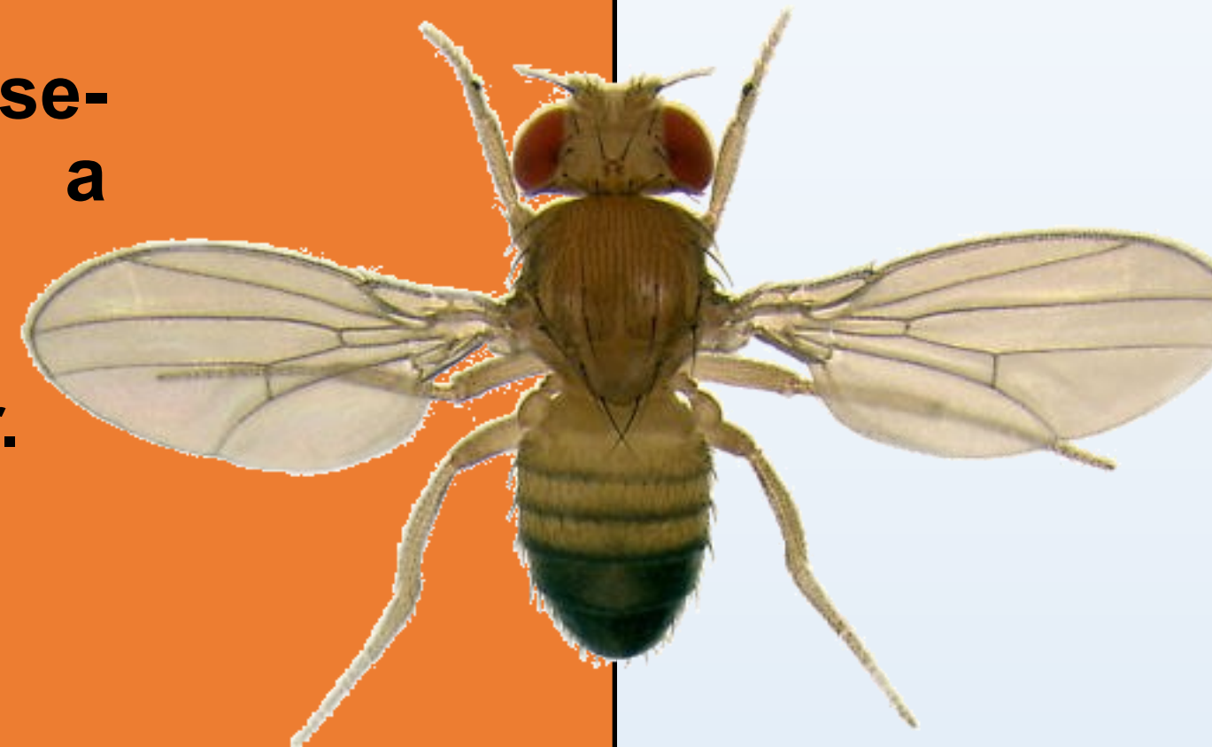
Figure 1. Close-up view of a male Drosophila melanogaster .